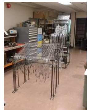
"The Secret Loom"

For more information see www.westcarletonartsociety.ca