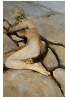
Acrylic on canvas