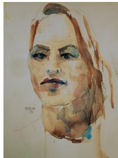
Portrait in watercolour