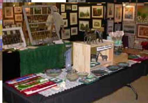
Just a few images from our Christmas Show & Sale